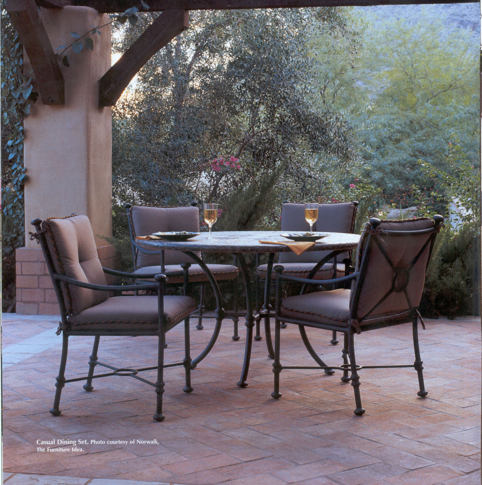
Casual Dining Set.